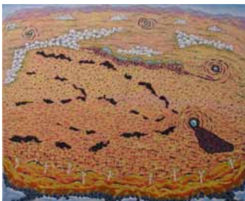
William YAXLEY Undaraland , 2010 oil on canvas 500 x 595 mm

The two artworks selected for purchase by the Friends of Cairns Regional Gallery represent landscape scenes of Far North Queensland.