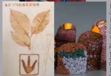
Mollie Bosworth, Untitled 2008