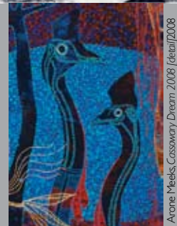
Arone Meeks, Cassowary Dream 2008 [detail] 2008